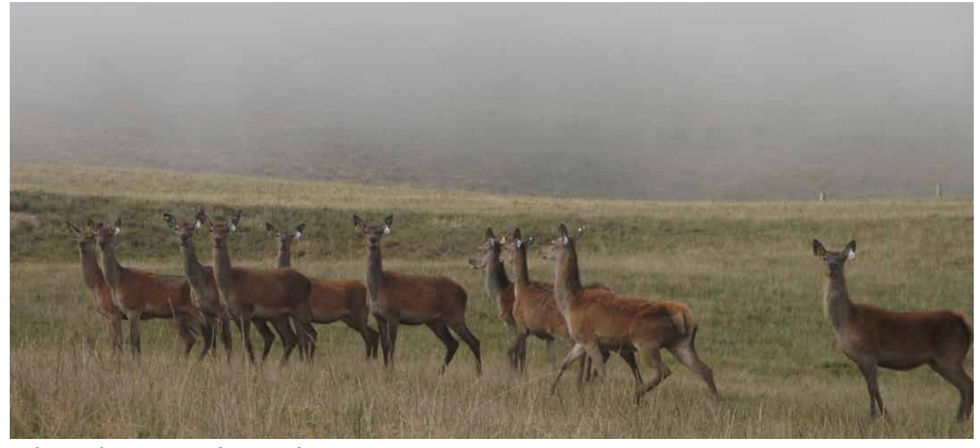
underway please see www.deeresearch.org.nz

Field days were held at which presentations were made by farmers and AgResearch researchers on optimising commercial returns by integrating breeding and finishing operations and different species of livestock.