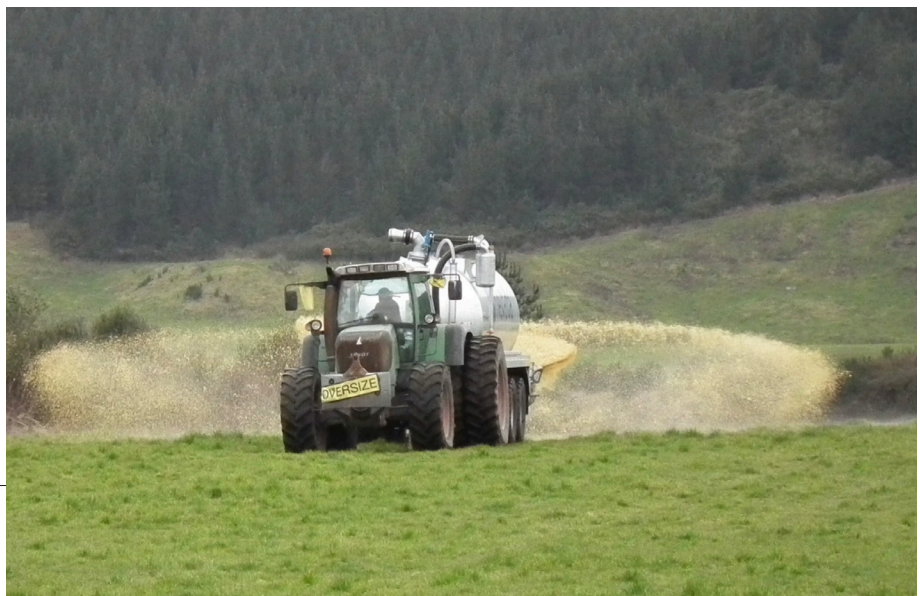
Storage and application of effluent may require resource consent.