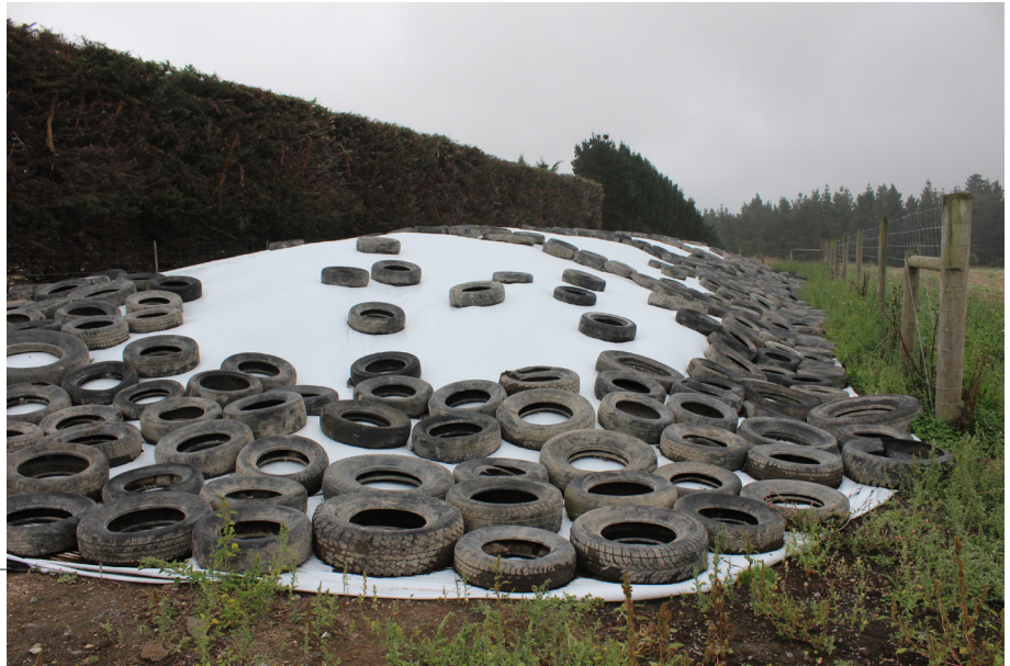
Ensure Silage stacks are sited well clear of waterways.

Leachate from silage is concentrated and very high in nutrients, especially nitrogen. It can contaminate waterways and a big discharge can kill all aquatic life.