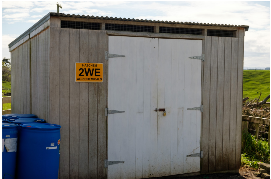
Hazardous chemicals should be safely and securely stored.