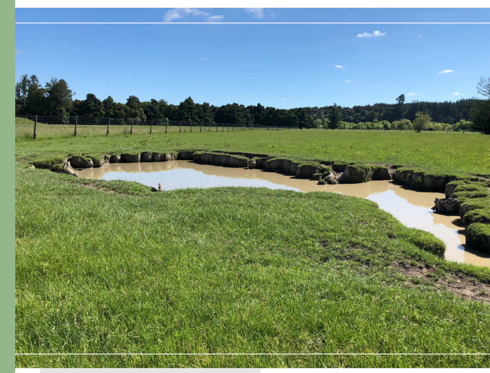
A wallow provided for deer on flat land, well away from waterways.