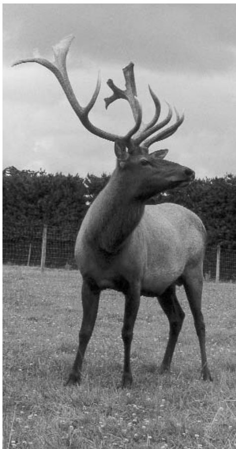
Research showed Wapiti genes influenced pregnancy rates in Red Hinds.

Wapiti deer have been used widely across New Zealand deer, and the percentage of