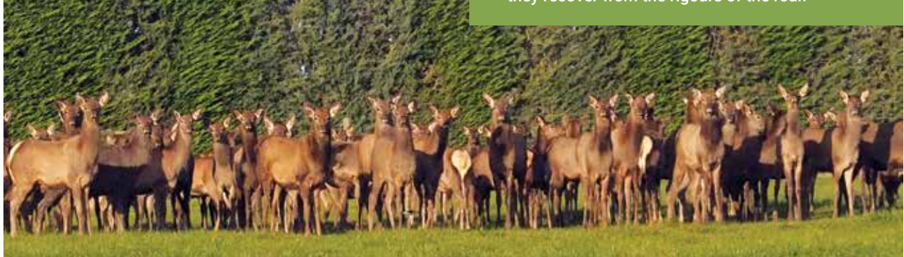
A picture of breeding, feeding and health: Elk/Wapiti crossbred weaners at Lynnford Farm in mid-June. Average weight on 1 May, 92 kg