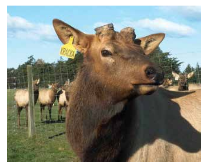
Kracka, an elk-wapiti sire owned by breeder Grant Hasse

Select terminal sires that are right for your farm. It is important to do this on the basis of breeding values (BVs) rather than on the basis of an individual stag or bull's raw data for eye muscle area or growth rate as a weaner. This is because a stag/bull does not necessarily pass his own performance on to his sons and daughters. The genetic