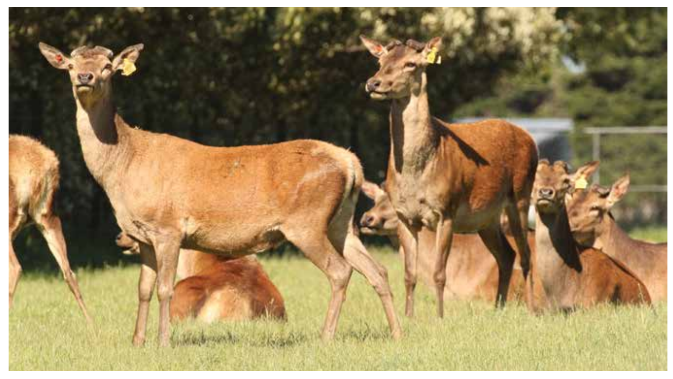
I broken I

In Deer Select, BVs are listed as plus and minus figures, with zero being the average of the national herd in 1995. For most traits, the higher the plus BVs of your stags, the faster you will achieve your targets. The only exception is the conception date trait, where you look for a minus figure (days earlier conceiving than average).