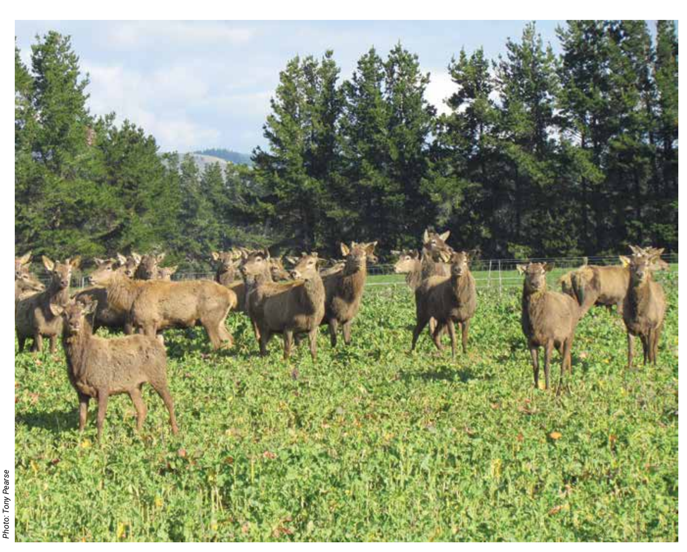
Leaching rates of N are likely to be higher in winter when plant uptake (and growth) is slower and the ground is wet