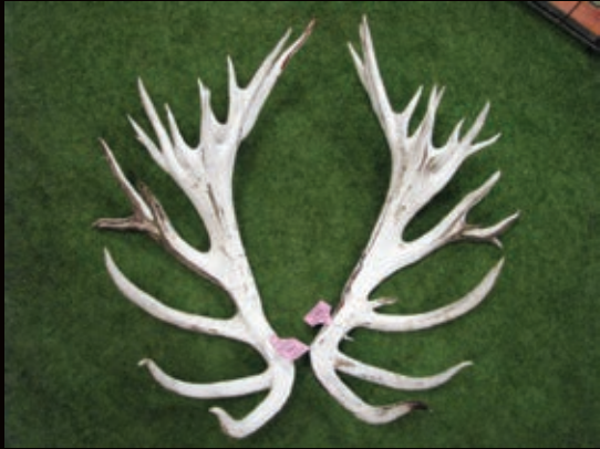
Stag Genetics | 904-1