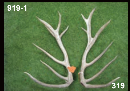
2nd Non – Typical Whyte Farming