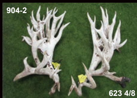
1st Stag Genetics