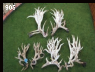
1st Deer Genetics NZ