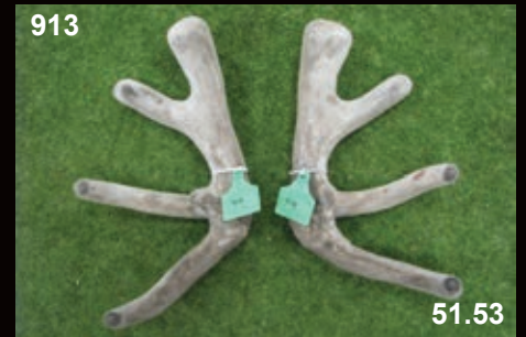
3rd Arawata Deer Farm