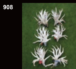
2nd Orr NZ LTD/Tower Farms