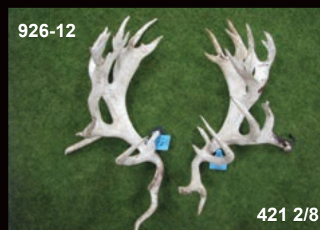
3rd Foveran Deer Park