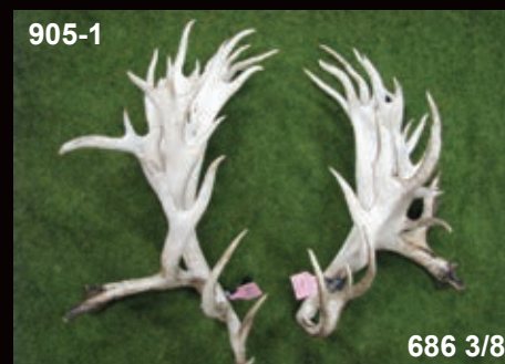
3rd Deer Genetics NZ