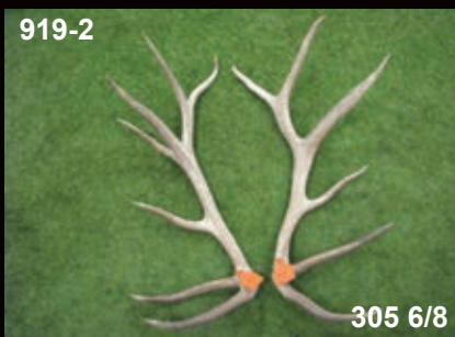
1st Typical Whyte Farming