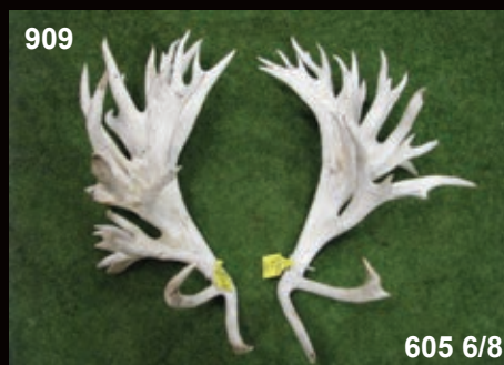
2nd Crowley Deer