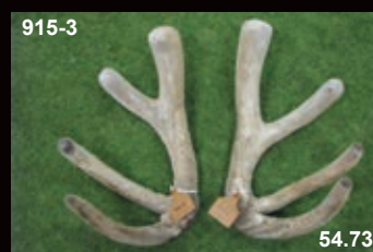
2nd D & D Lawrence