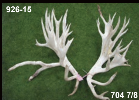
2nd Foveran Deer Park