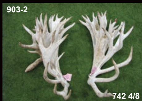
1st Rockvale Deer Stud