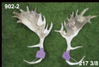
1st Pinewood Deer Farm