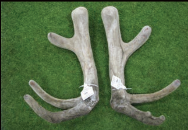
Tower Farms | 916