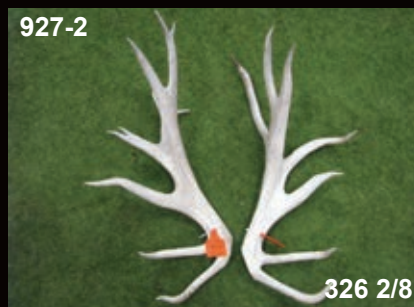
1st Non – Typical Raincliff Station