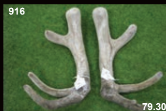
2nd Tower Farms