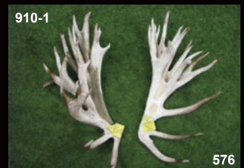
3rd Black Forest Park