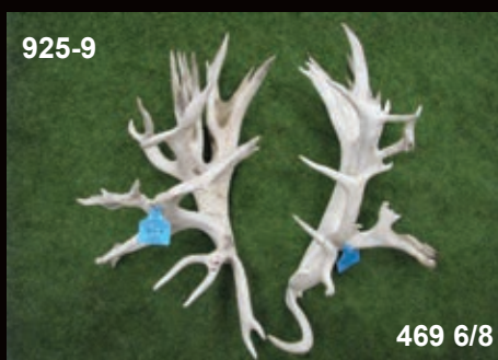
2nd Peel Forest Estate