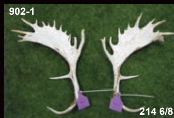
2nd Pinewood Deer Farm