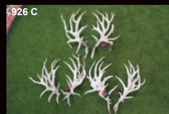
3rd Foveran Deer Park