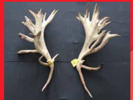
3rd Hillend Farms: TODD - 428-1