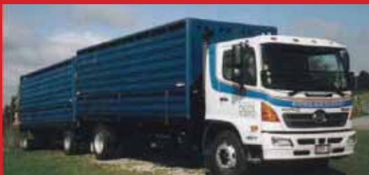
Rotorua Deer Transport

People's Choice Trophy - Hard Antler Sponsored by