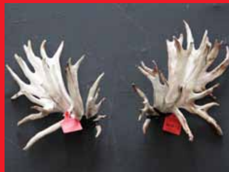
2nd Rockvale Deer Stud: Y.249 - 410-2