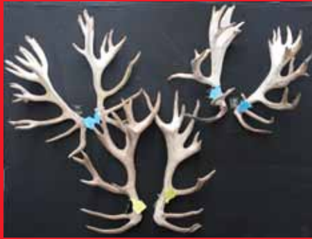
2nd Deer Genetics: HUNERIC-DG - 400-A