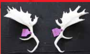
1st Sheerwater: 33 - 422-1