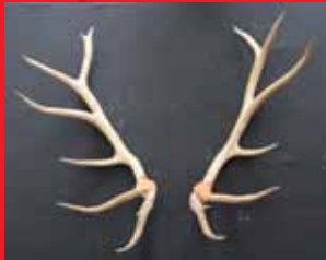
1st TYPICAL Whyte Farming: TORONTO - 407-4