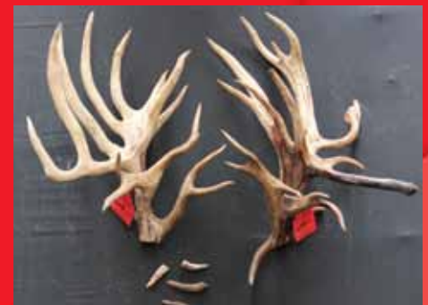
3rd Mount Hutt Station: HOODSTAR- 408-1