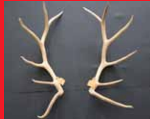
2nd TYPICAL Whyte Farming: B85 - 407-3