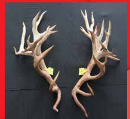
Peel Forest Estate: 102240 - 409-2