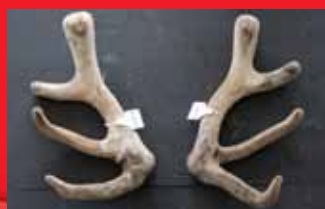
2nd - Peel Forest: WALTON - 409-3