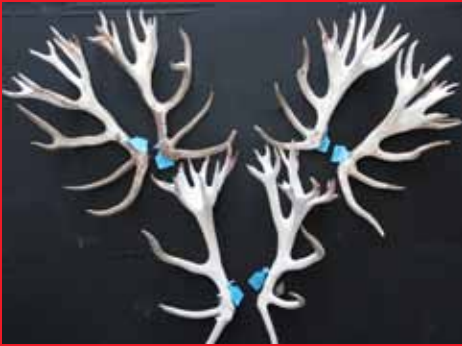
1st Deer Genetics: MENTOR-DG - 400-B