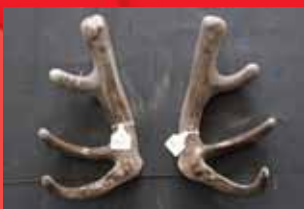
1st - L Tayles: THE PROPHET - 431-1