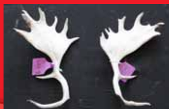
2nd Sheerwater: 43 - 422-2