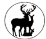
Deer Reproduction Services