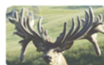
TROJAN DEER FARMS