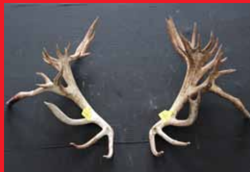
2nd Mt. Cecil: TENBY - 423-1