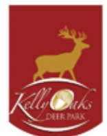
Breeders of Distinction