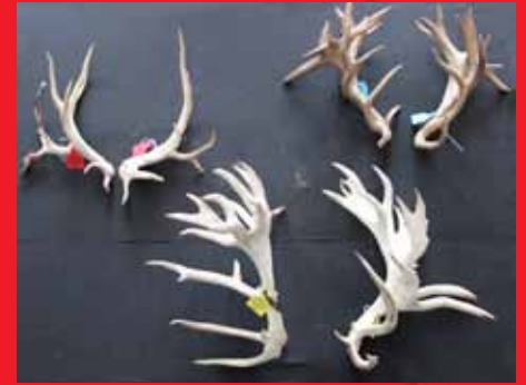
3rd C & D Petersen: SOVEREIGN II - 419