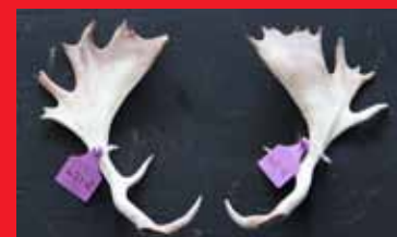
3rd Pinewood: Y111 - 421-2