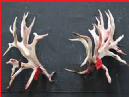
1st Forest Road Farm: JÄGER BOMB - 424-1