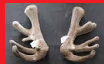
3rd - B & J Oliver: CLINTON - 427-1