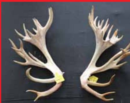
1st Kelly Oaks: DUKE - 414-1