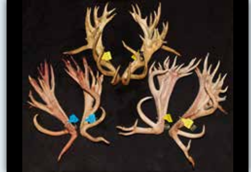
2nd C&D Petersen / Highden Deer 611 Kallis