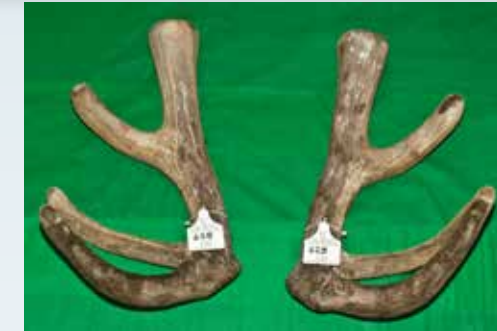
Tower Farms 09 9208 10.17kg