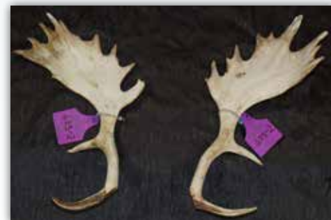
2nd Pinewood Deer 625-2 Blue 94 Black Balls / Pinewood 148