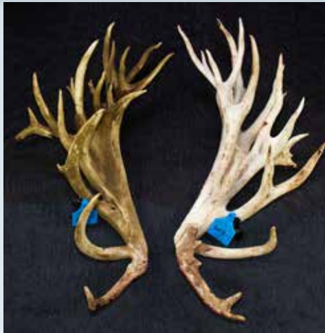
People's Choice Trophy - Hard Antler Sponsored by