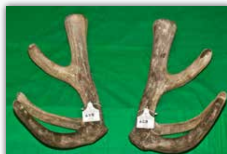
1st Tower Farms 09 9208 6yrs 10.17kg