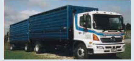
Rotorua Deer Transport