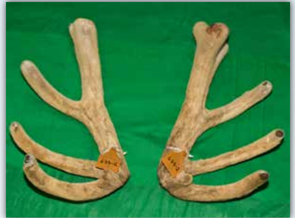
1st Tikana 635-2 Thor 6.69kg