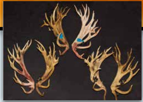
1st Canes Deer 603 Odysseus