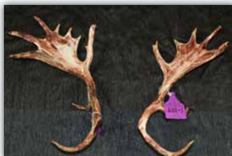
1st Rothesay Deer 622-1 Darkie Bristow / Rothesay 159 1/8