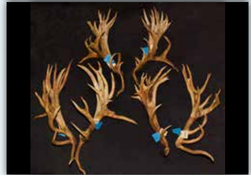
3rd Rothesay Deer 622 109