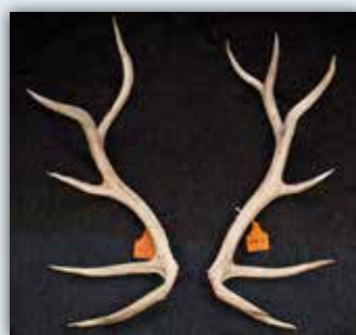
TYPICAL: 1st Whyte Farming 618-2 WP 934 Big Steve / Whyte Farming 259 7/8