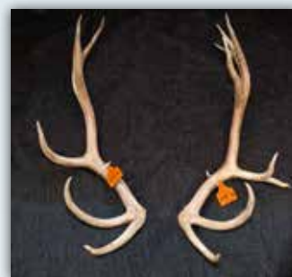
NON TYPICAL: 1st Whyte Farming 618-4 WP 988 P 920 / Whyte Farming 291