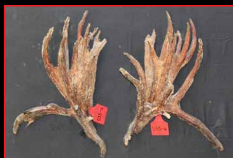
2nd Rockvale Deer Stud: Y345 - 535-4