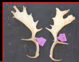
2nd Pinewood Deer: ORANGE82 - 534-2