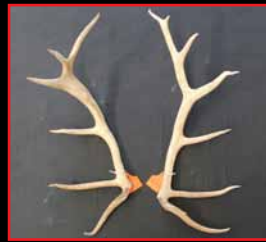
2nd TYPICAL Whyte Farming: WG891 - 504-4