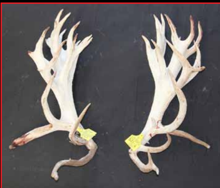
1st Deer Genetics: LEONIDES DG - 521-4