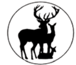
Deer Reproduction Services