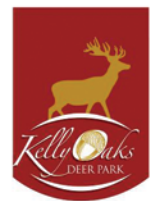
Breeders of Distinction