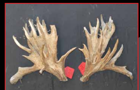
3rd Tower Farms: 3004 - 533-3