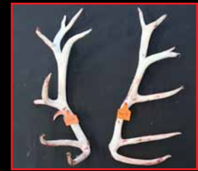
2nd NON TYPICAL NZ Bison: W6850 - 514-2