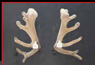
2nd - Gloriavale: MEGASTAR - 549