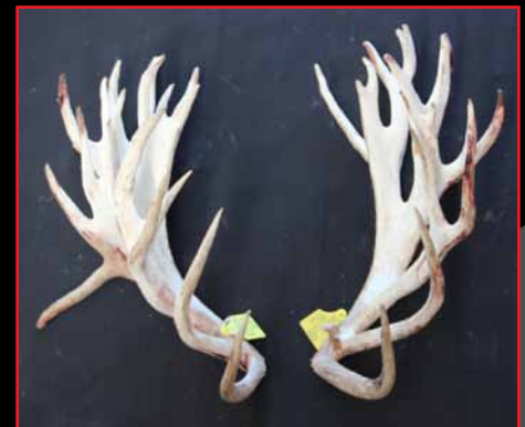
3rd Deer Genetics: PHANTASOS DG - 521-3