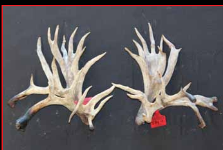
1st Pinewood Deer Farm: 13G96 - 534-1