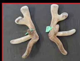
2nd - Dalmore Deer: 12-7 - 506-2