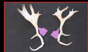
3rd Sheerwater: BLUE7 - 543-2