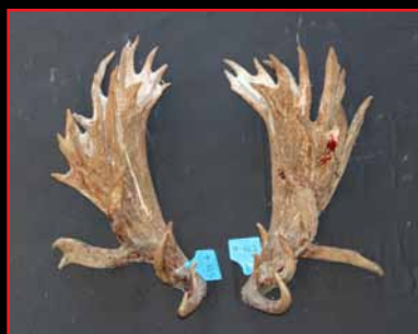
2nd Rockvale Deer Stud: Y266 - 535-6