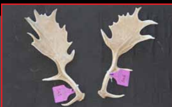
1st Amber Moore: NOODLES - 545