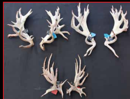
3rd - Highden Deer: KALLIS - 500-C