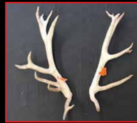
1st NON TYPICAL NZ Bison: W6859 - 514-3