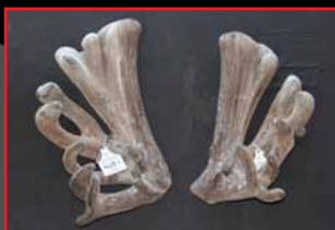
1st - B Oliver: BAYLEY - 548-1