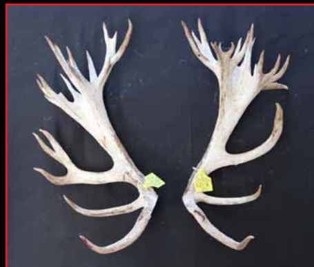
2nd Deer Genetics: IMBRIUS DG - 521-6