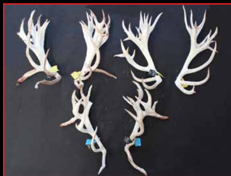
2nd - Deer Genetics: HUNERIC DG - 521-A