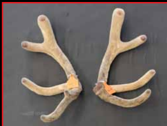
1st - Tikana: ISOBAR - 501-9