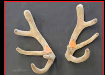
3rd - Whyte Farming: WG330 - 501-1