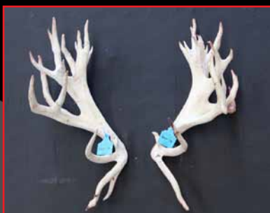
1st C&D Petersen: PINK 100 - 500-13