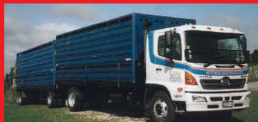
Rotorua Deer Transport

People's Choice Trophy - Hard Antler Sponsored by