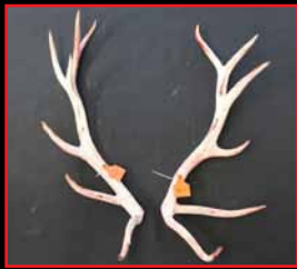
1st TYPICAL NZ Bison: W6866 - 514-1