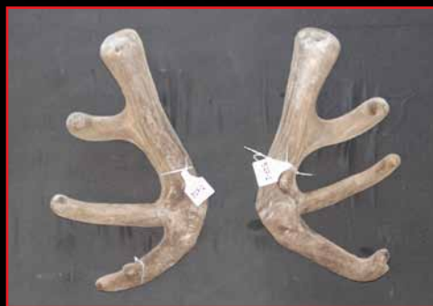
D & K Hudson: McCAW - 527-2