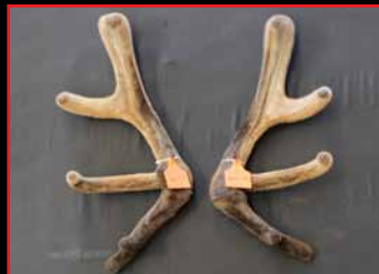
2nd - Whyte Farming: BUCK - 501-10