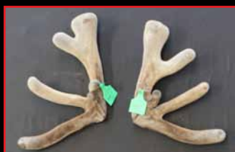
1st - Dalmore Deer: 12-71 - 506-1