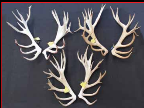
1st - Highden Deer: PRINCE PHILLIP - 500-A