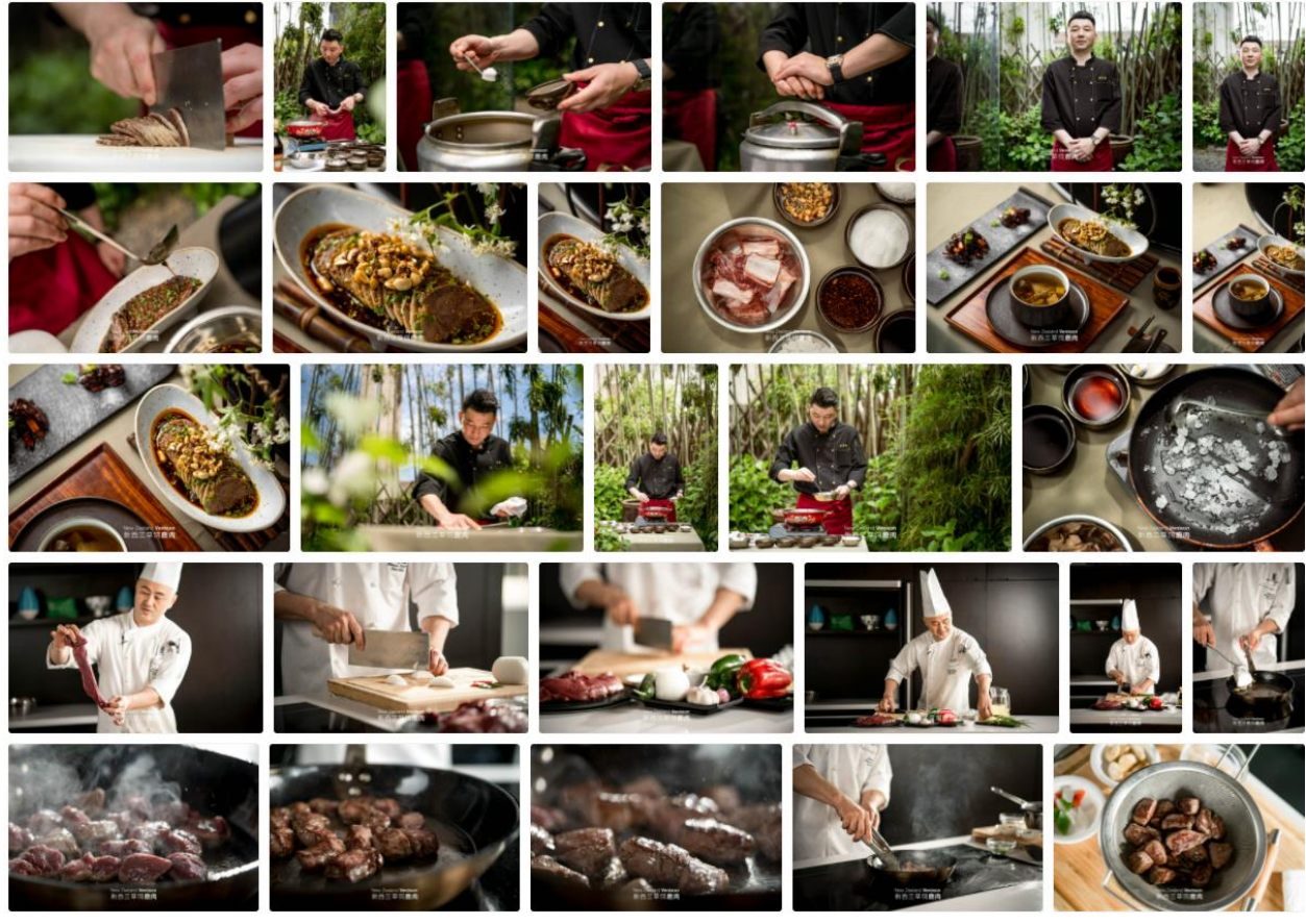
240 images have been captured for companies to use in their marketing activities.

The chef research project has been completed.