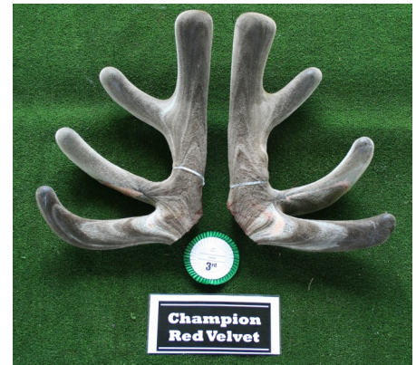
HUNTER RED DEER