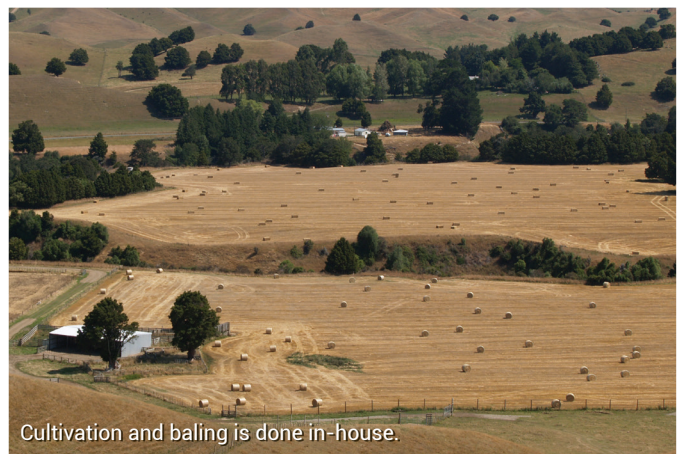
Cultivation and baling is done in-house.