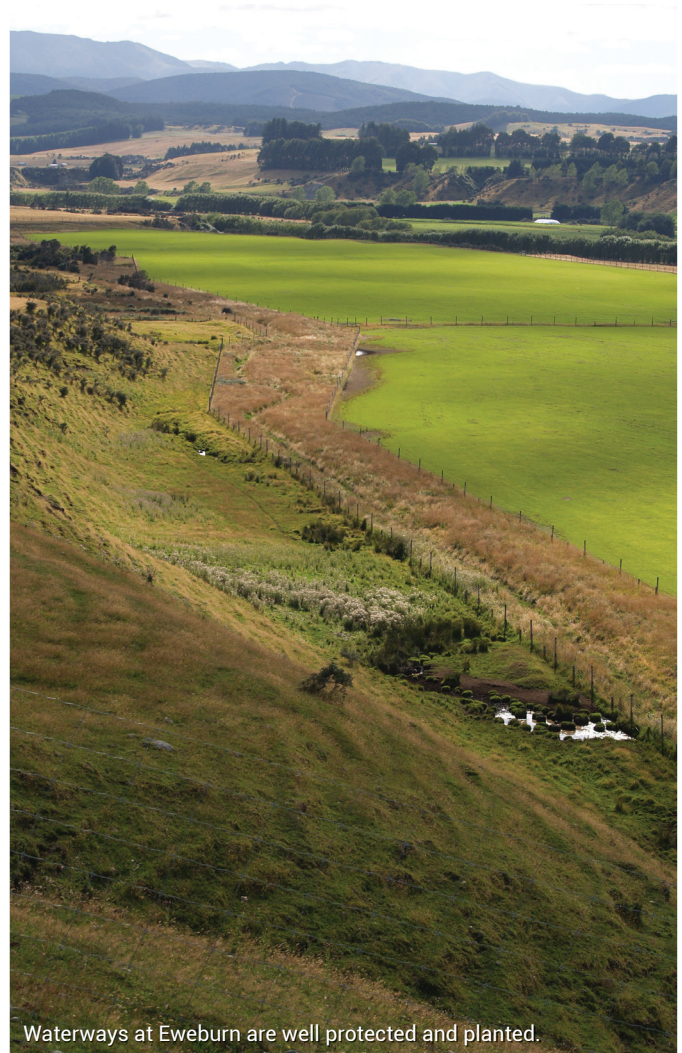
Waterways at Eweburn are well protected and planted.

Waterways are well protected and planted, with a major waterway, the Upukerora River, running adjacent to the south-western corner of the property, ensuring that water leaving the farm is not contaminated.