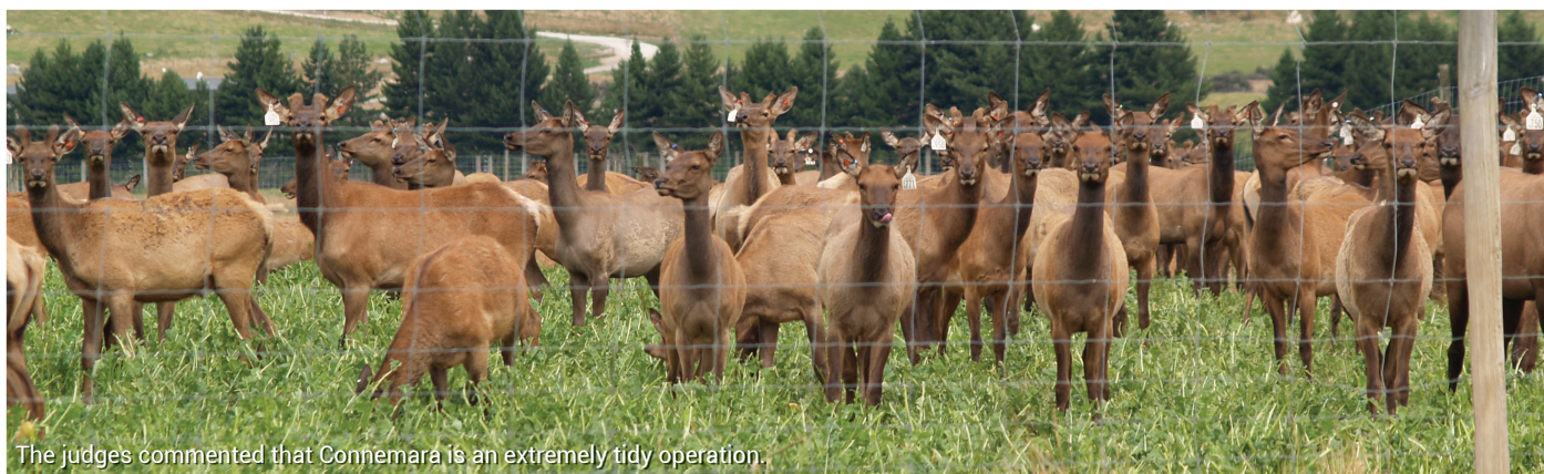
The judges commented that Connemara is an extremely tidy operation.

Connemara is an extremely tidy operation committed to quality farming, high-performing stock and managed by a passionate team who are willing to adopt new technologies and give things a go. Sustainable systems and excellent land care are features of the now well-established operation.