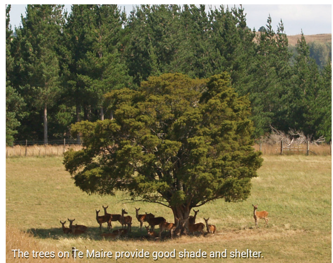
The trees on Te Maire provide good shade and shelter.

Since 2011 the business has completed a from finishing bulls to running dairy grazers. Running both at the same time during the change was a difficult juggling act, but did spread the risk of selling out the cattle over two years. Heifers are contract grazed on a weight gain basis. The grazing works well for cash flow, but is not so great for pasture management mobs are rarely available to clean up a paddock. One hundred and forty R2 steers are bought in June and run through until December to manage the grazing pressure in spring.