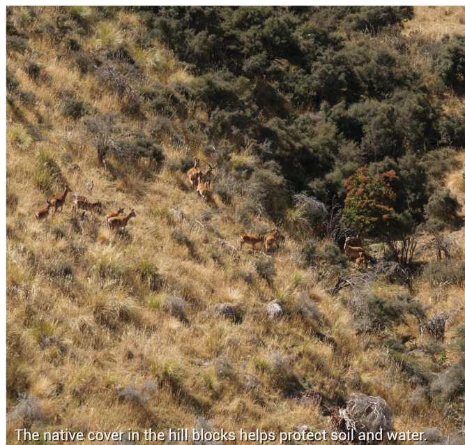
The native cover in the hill blocks helps protect soil and water.