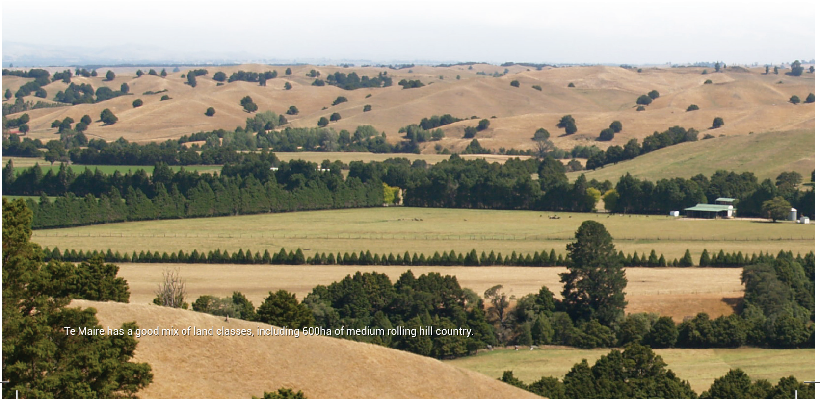
Te Maire has a good mix of land classes, including 600ha of medium rolling hill country.