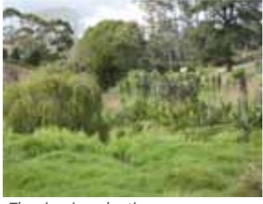
The riparian planting programme uses a mix of native wetland plants.