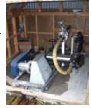
This Pelton wheel pumps 200,000 litres of stock water per day up 180 metres and saves $14,000 per year in electricity costs.

Retention of the tussock grasslands is critical in an environment of thin poor soils and extremes of weather,