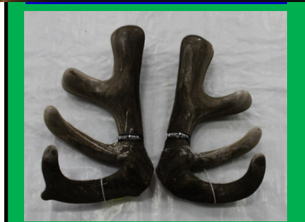
F.J. Ramsey Investments Ltd 'Champion Red Velvet'