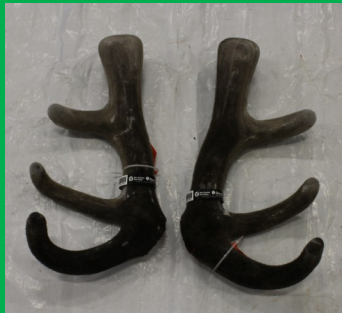
F.J. Ramsey Investments Ltd '4 Year Red Velvet'